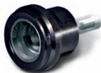
Single-channel adapter for pipettes without tip