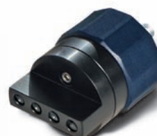
Multichannel adapter for pipettes with and without tip