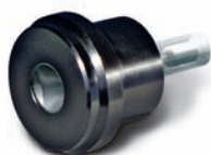
Single-channel adapter for pipettes with tip