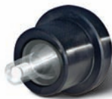
PE filter in single- and multichannel adapters