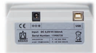
Back of the instrument with AC adapter socket and USB port